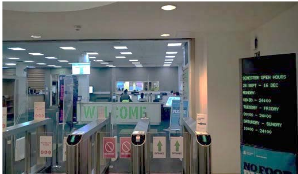
Entrance to the library