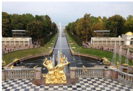
View from Peterhof on to the finish sea breeze