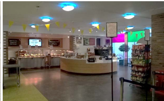
Cafeteria for the business students