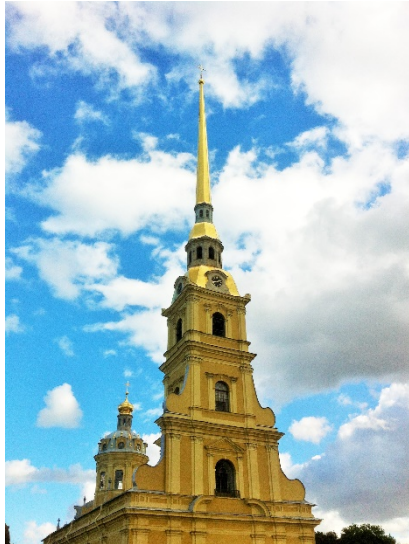
Peter and Paul's cathedral

Since 2012, the UNECON (Saint-Petersburg University of Economics: a state University for economics and finance based in Saint-Petersburg) and the UAS Landshut have been cooperating on a regular basis.