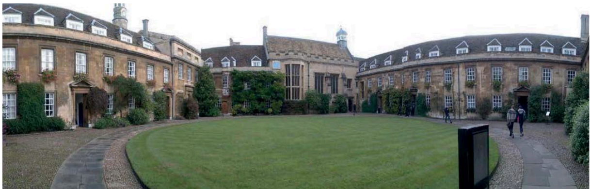
King's College area