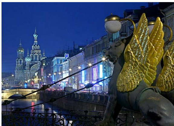
St. Petersburg at night