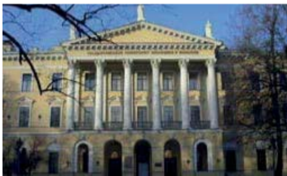
Main building of the University UNECON