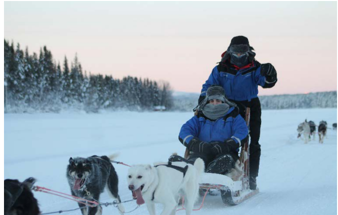
On the way with the dog sledge

Many students ask themselves the question: Can I go abroad again during my Master's degree and complete a semester there? The answer is: Yes, definitely! I knew that I wanted to spend another semester abroad. Since I always was a big fan of Scandinavia, the partner University in Kristianstad in the south of Sweden offered me a place.