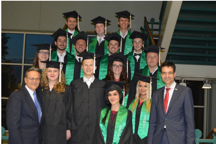
Graduation Ceremony USC Upstate

Twelve students of the Bachelor's program 'International Business' spent two semesters at our American partner University of South Carolina Upstate.