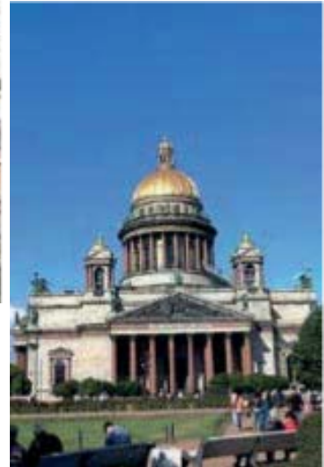
St. Isaac's cathedral