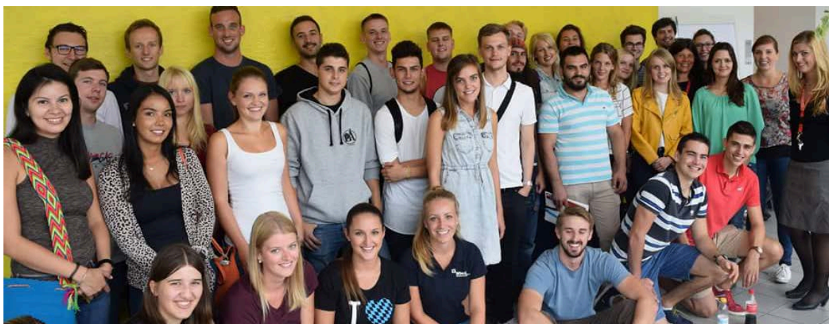
The international students from Landshut University, group 2016

Finally, we see the responsibility with the whole world and environment Germany is taking over. Bio products are getting more common in Germany and the policies are better in boosting these kinds of changes and making the people take care of these topics. Maybe, as the greater power in Europa, they have more responsibility in those topics, but this doesn't exclude other countries to do it. For example, in Spain there are just 500 Syrian refugees, and in Landshut our neighbours are even more and with better commodities than in Spain.