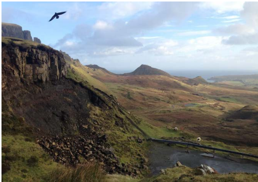
The Highlands in Scotland

You spent one year in Edinburgh. Why did you choose to study in Great Britain?