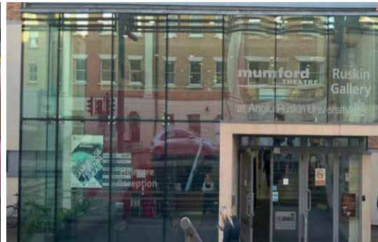
Entrance to the ARU