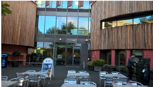
Entrance to the Lord Ashcroft Building (LAB)