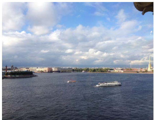
View from the Winter palace on to Newa