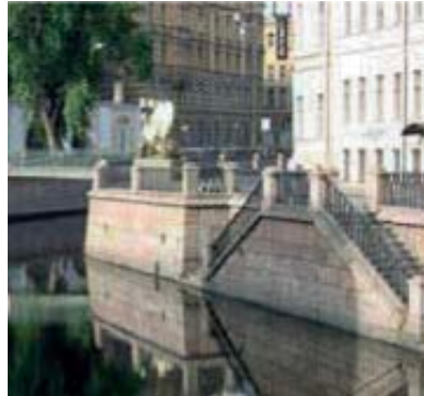
Bank bridge across the river Griboedova