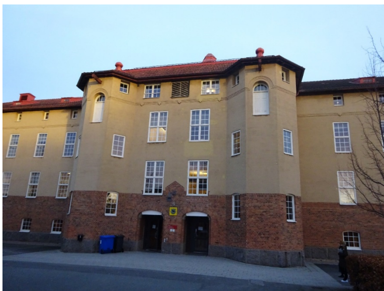
Buildings on the campus of the Högskolan University