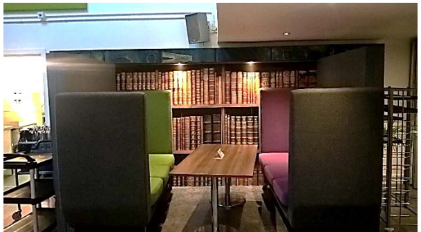
Area to relax in the cafeteria