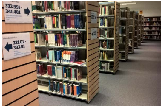
Several levels make up the library